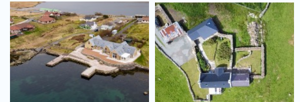
Aerial photos provide an unrivalled property view A vertical view offers a unique perspective

Our aerial photo and video option offers fantastic value for money. Using our fully stabilised integrated camera systems we provide 20MP JPEG stills and stunning 4K UHD video, ideal for print, web and social media marketing. Our packages start from just £199 inc VAT which includes up to 10 JPEG stills or two minutes of unedited 4K UHD video.