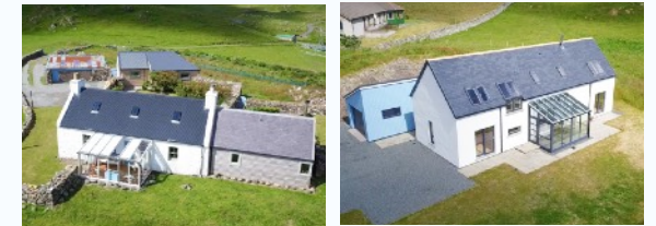
An aerial view without using a drone! Photo up to 12m (40') high

Using our 12m (40') telescopic pole we can provide an elevated view even in heavily congested areas where flying is not possible. Our high quality cameras have zoom lenses and provide 18.2MP stills and 1080p HD video. Pole packages are available from just £149 inc VAT for up to 10 JPEG stills.