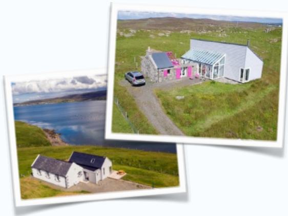
Advanced unmanned aircraft technology and high quality cameras produce superior aerial imaging

Shetland Flyer Aerial Media offer a wide range of media services using our professional cameras and fleet of advanced Unmanned Aerial Systems (UAS). From high quality interior, exterior and aerial media projects to 360° VR panoramic tours, we can provide smart and cost effective solutions tailored to your specific requirements. We also offer extensive in-house post production services and media hosting, providing you with the complete package.