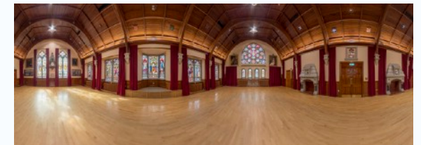
Our interactive 360° x 180° VR panoramas and tours put your clients right in the centre of the picture

The one stop shop for all your marketing media requirements, we offer interior and exterior photo and video, aerial photo and video, and 360° interior, exterior and aerial VR panoramas and tours. Professionally produced media gets real results from your marketing material, and we can manage your projects from capture to final output. Contact us to discuss your requirements.